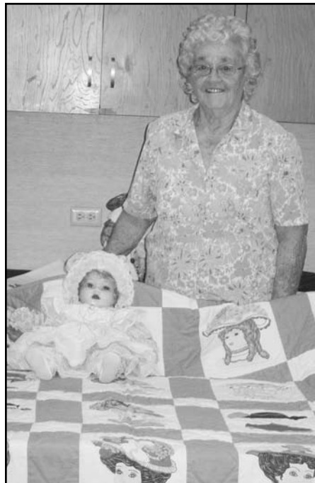
“Art for the Ages” displayed by the residents during Assisted Living Week.