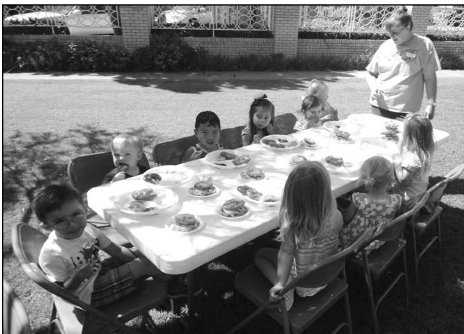
Nothing beats corndogs and funnel cakes on a pretty day!