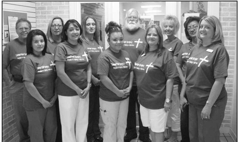
Samaritan Hospice Staff