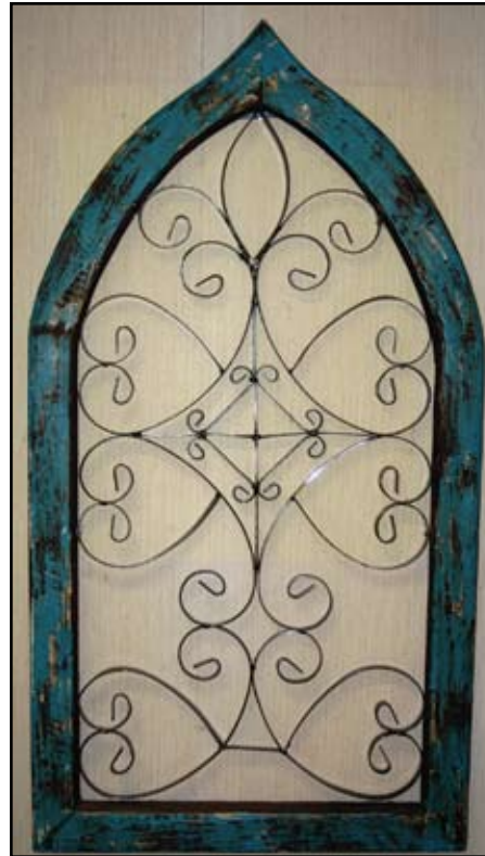
Turquoise Cathedral Wall Art