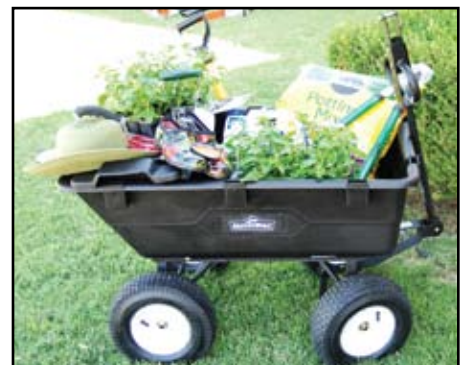
Deluxe Garden Dump Truck filled with gardening tools and accessories.