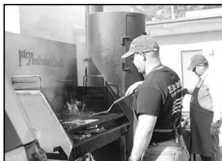
Mind the flames and the cooking speed—skilled grill cooks made for savory fare at the King's Manor Burger Benefit.