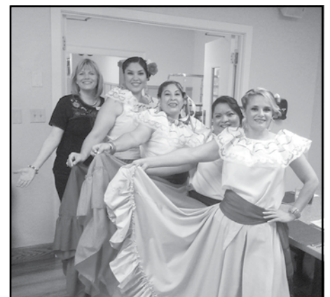
Our very own Kings Manor Fiesta Dancers + one.